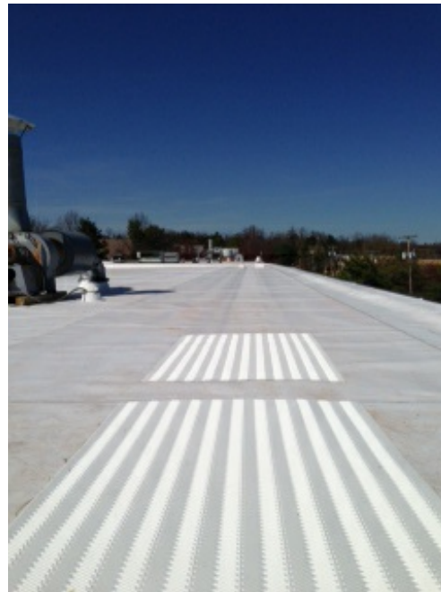
Hagelin Flavor Technologies Branchburg, NJ

This roof had chronic leaking issues that were addressed by other contractors with no success. We were able to finally solve the issue while staying under budget and granting them a 15 year warranty!