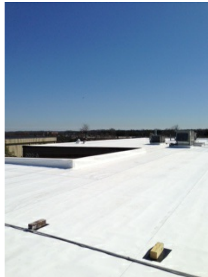
White Roofs Keep Buildings Cooler

Eco-friendly roofing materials are not a fad. White, or reflective, roofs have been in use for the past 20 years. Commonly referred to as "cool roofing", they have been designed to reflect more sunlight and absorb less heat than a standard roof. Cool roofs can be made of a highly reflective type of paint, a sheet covering, or reflective tiles