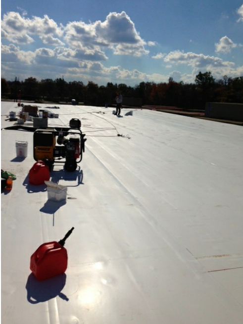
Hercules Enterprises Hillsborough, NJ

This roof was severely damaged from Superstorm Sandy. Not only did portions of the roof blow off but the steel decking was compromised by the high winds. All decking was replaced with new. We then came in and installed a layer of 1" Polyisocyanurate R-value 6.0. Over the Polyiso, we installed a layer of ¼" Securock coverboard. We then installed a Versico 60mil fully adhered TPO white membrane roof system.